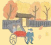
Kakunodate samurai residences