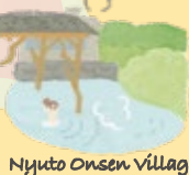
Nyuto Onsen Village