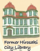
Former Hirosaki City Library