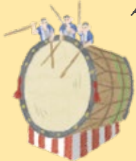
Tsuzureko big drum