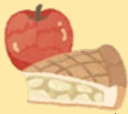
Apples & apple pie