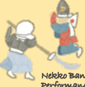
Neko Bangaku Performance